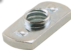
30-3789 5/16-18 thread size