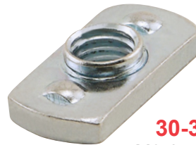
30-3796 M8 thread size